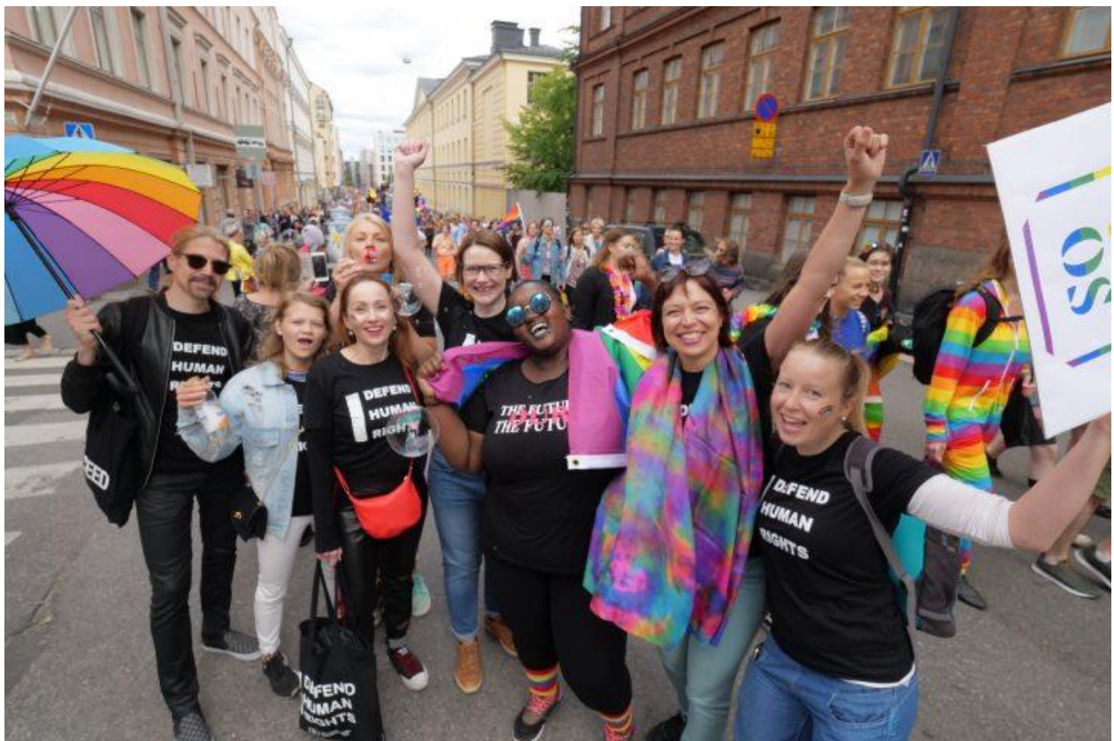
Some of KIOS staff with Kenyan human rights activist Njeri Gateru at the Helsinki Pride Festival in 2019.