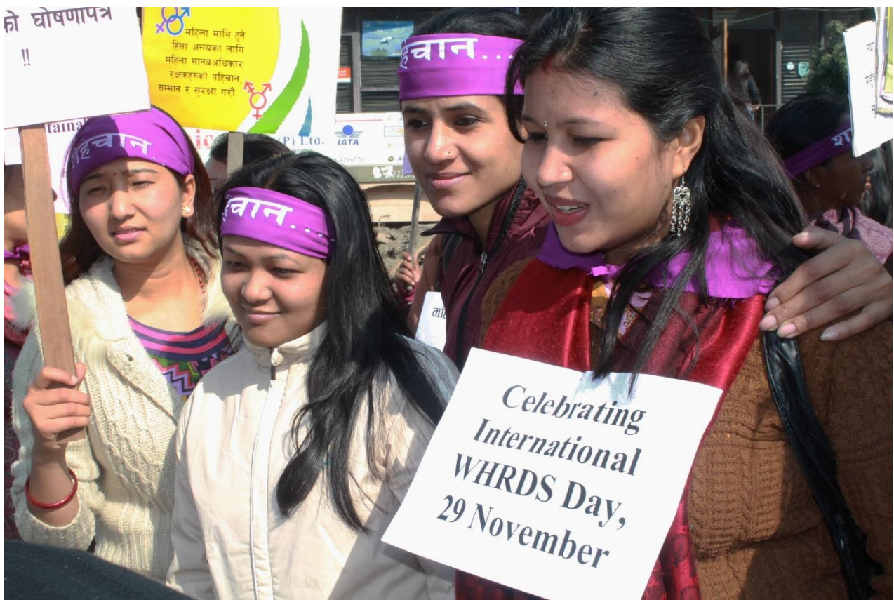
Women Human Rights Defenders in Nepal.